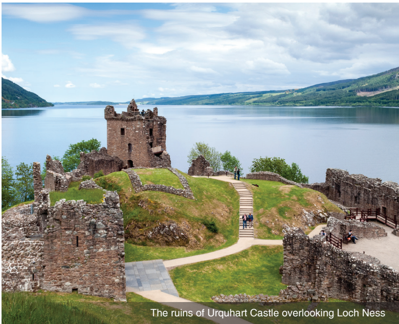
The ruins of Urquhart Castle overlooking Loch Ness

with dramatic scenery and striking architecture. During the panoramic city tour, see the historic Old Town and the elegant Georgian New Town, both UNESCO World Heritage Sites. Visit the city's icon, Edinburgh Castle, perched high atop a hill, offering panoramic views of stately mountains, rolling hills and lovely countryside. Inside the castle, stand in awe of the Scottish Crown Jewels, featuring the crown, sword, and scepter, which are among the oldest regalia in Europe. After free time for lunch on your own, depart for Roslin, a tiny village outside Edinburgh, where you visit Rosslyn Chapel. This 15th-century church is famous for its decorative art and mysterious associations with the Knights Templar and the Holy Grail. This evening, dinner is included. Meals: B, D