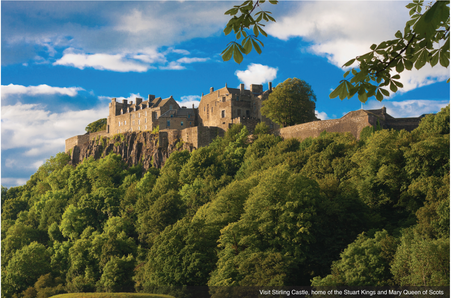
Visit Stirling Castle, home of the Stuart Kings and Mary Queen of Scots