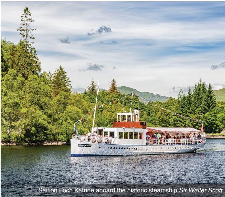
Sail on Loch Katrine aboard the historic steamship Sir Walter Scott