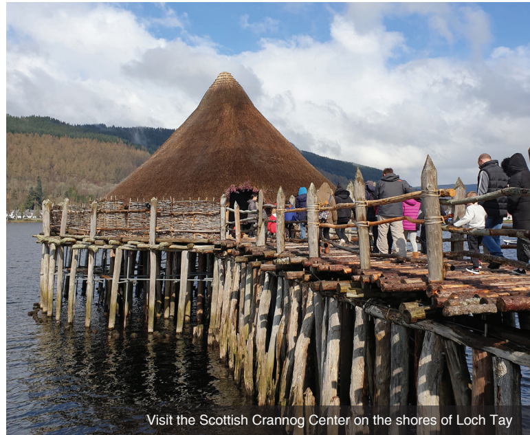
Visit the Scottish Crannog Center on the shores of Loch Tay

DAY 1 Depart the USA: Depart your gateway city on an overnight flight to Glasgow, Scotland.